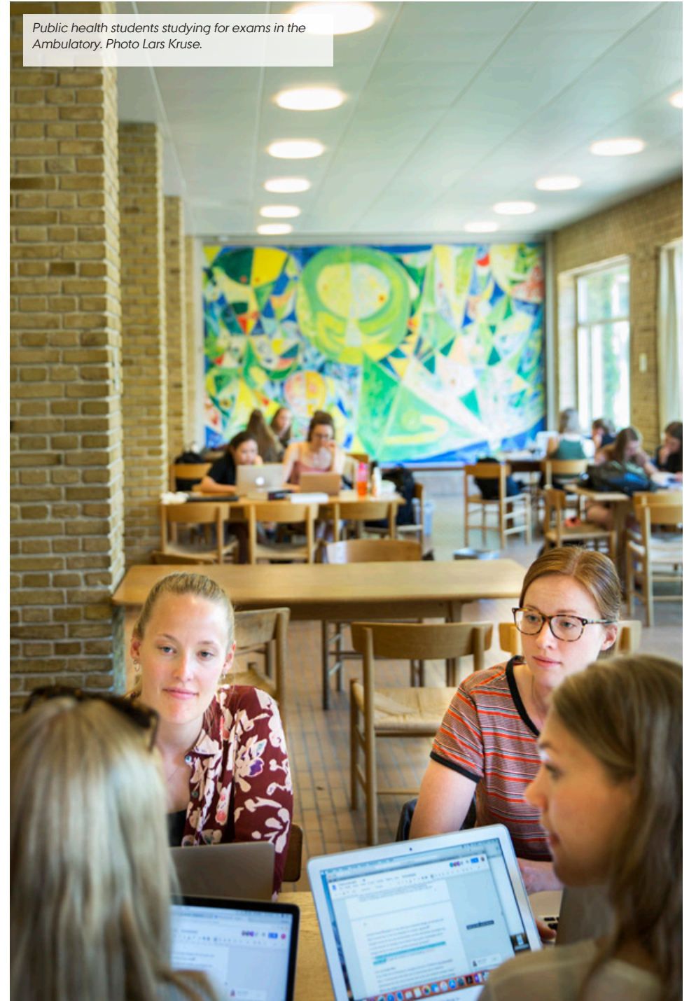
Public health students studying for exams in the Ambulatory.

AU is a campus-based university where the physical environment must contribute to a stimulating learning and teaching environment. All students must have a wide range of options to participate in academic and social communities characterised by a focus on engagement, inclusivity and relevance. Together with the degree programmes, the directors of studies and the vice-deans for education at AU, students must contribute to creating an inclusive learning environment where the values of respect and decency support everyone in saying no to harassment, bullying, violent behaviour and discrimination.