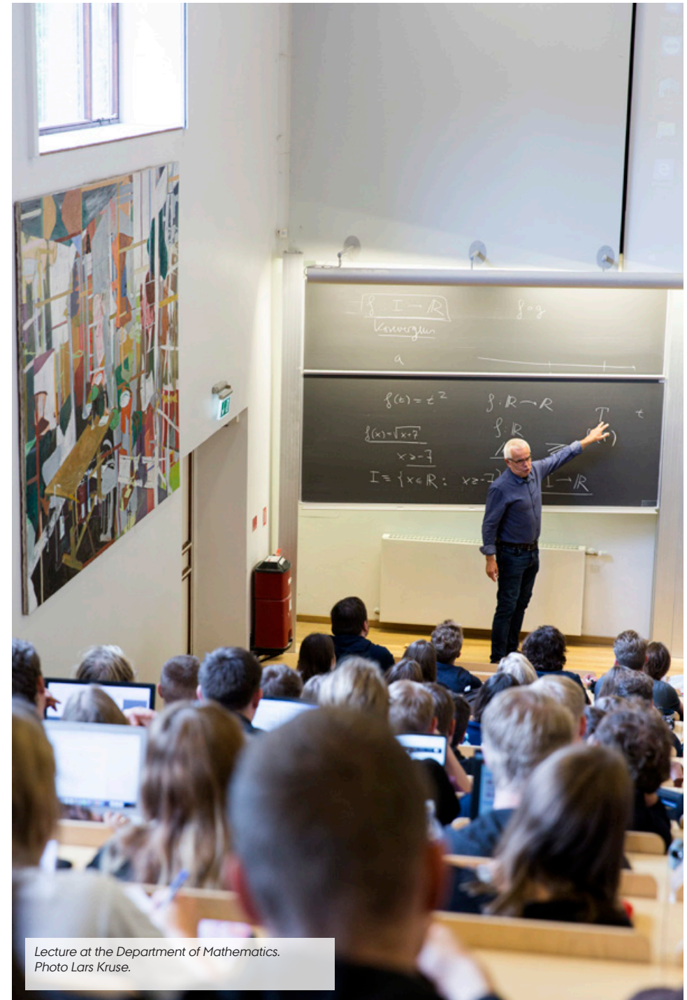
Lecture at the Department of Mathematics.

Teaching must support learning through varied, activating learning processes that enable students to master the subject knowledge, skills and competencies of the course. The types of examination selected must ensure that mastery of the material is assessed and student performance is evaluated fairly.