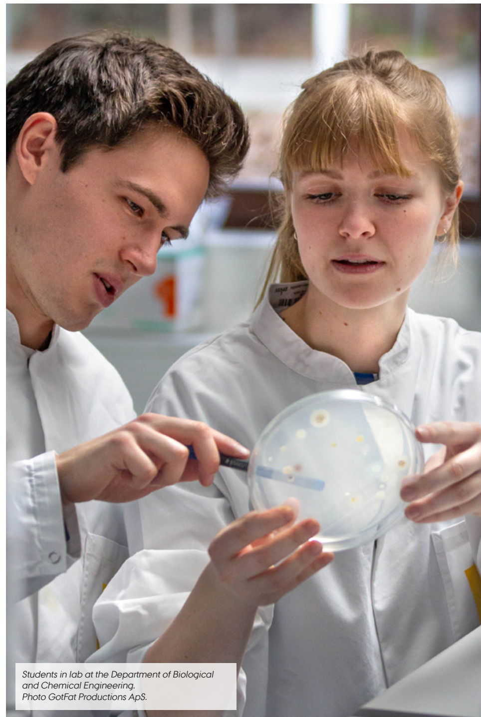
Students in lab at the Department of Biological and Chemical Engineering.

At AU, students must encounter degree programmes that are developed and designed with the involvement of relevant employer perspectives. To ensure this, employers must be involved in the ongoing process of developing the quality of AU's degree programmes.